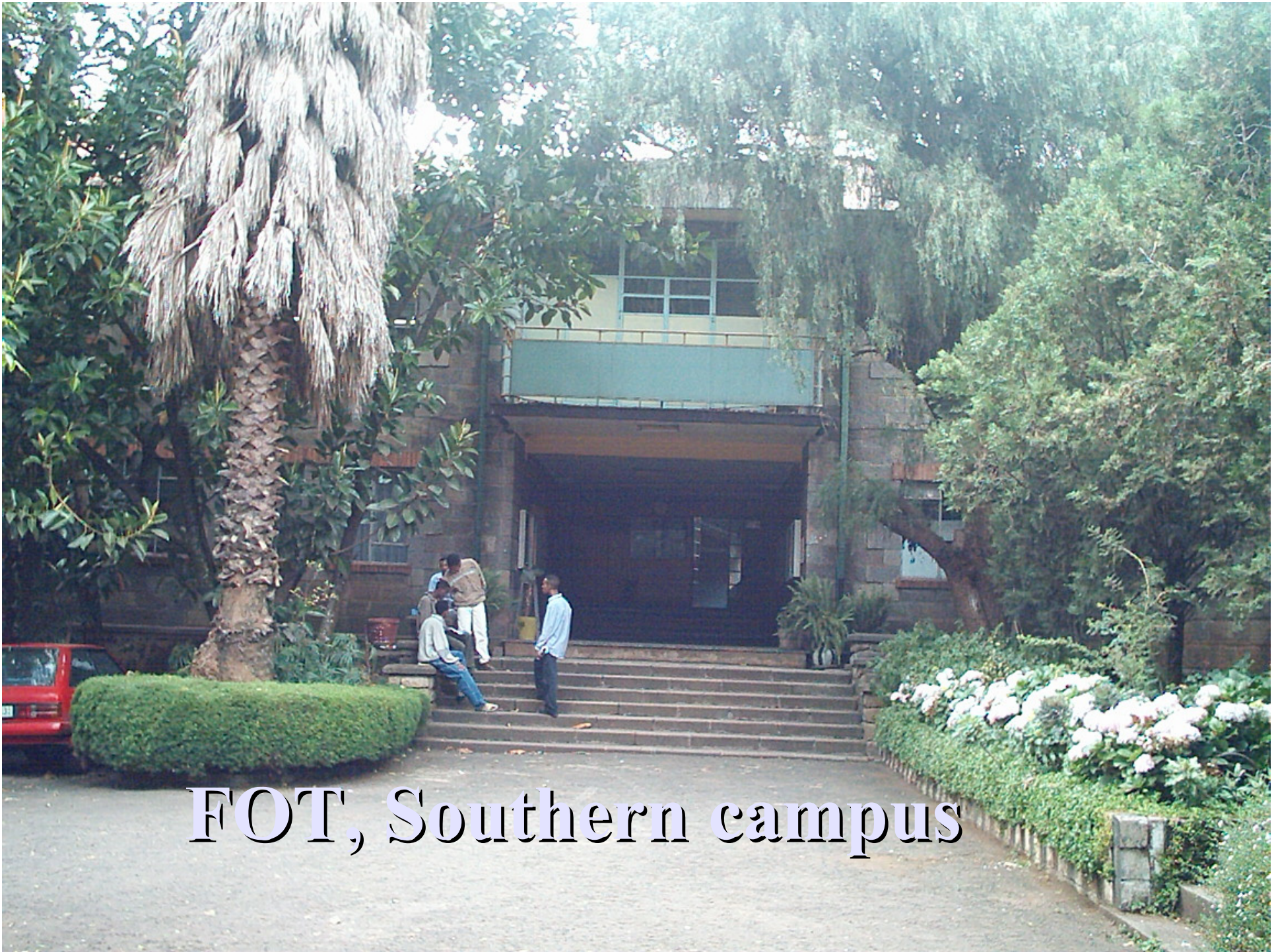
FOT, Southern campus