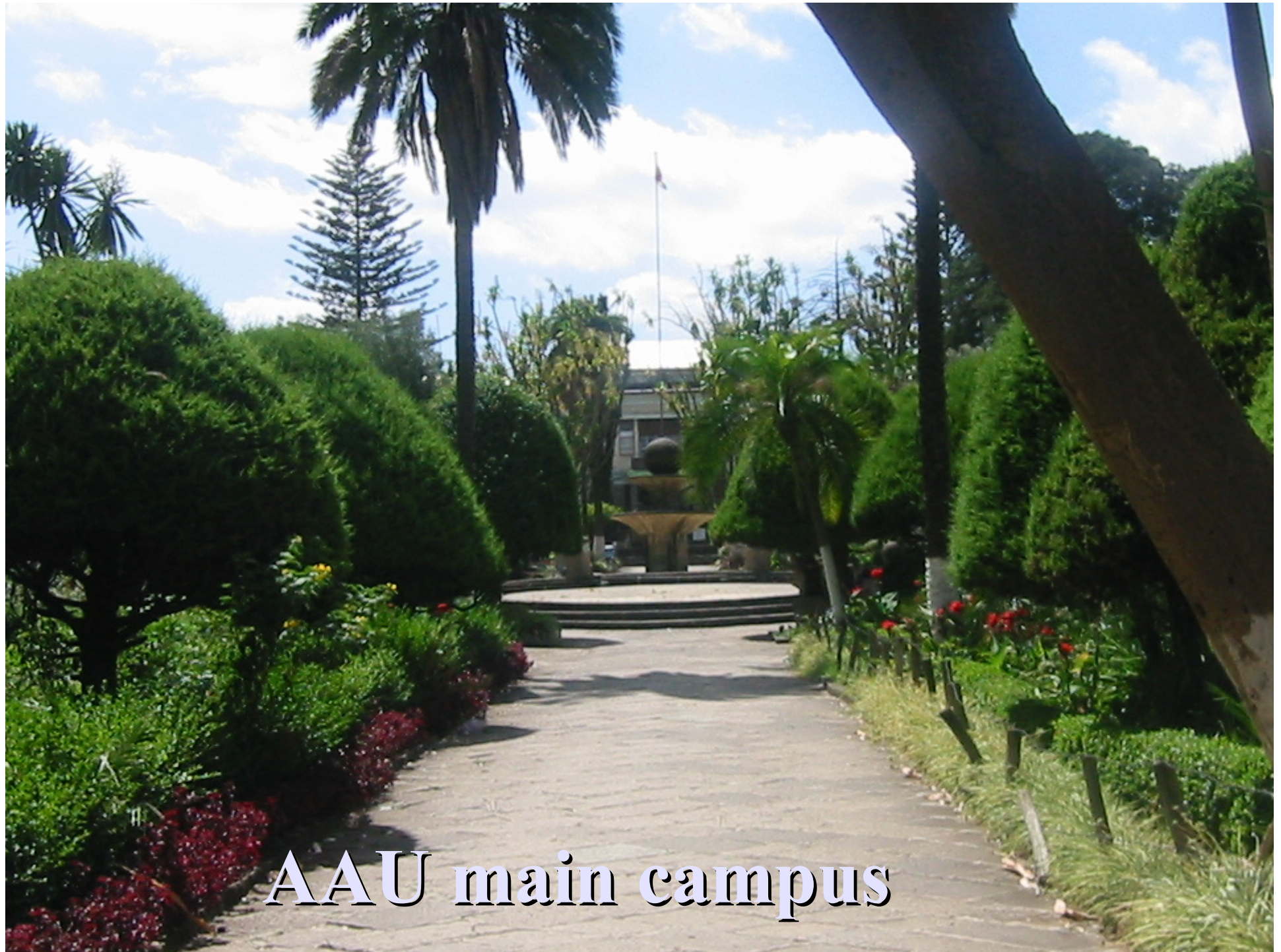
AAU main campus